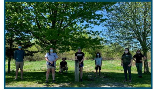
Images above from 2020 WISP training. Map below indicates launch coverage.