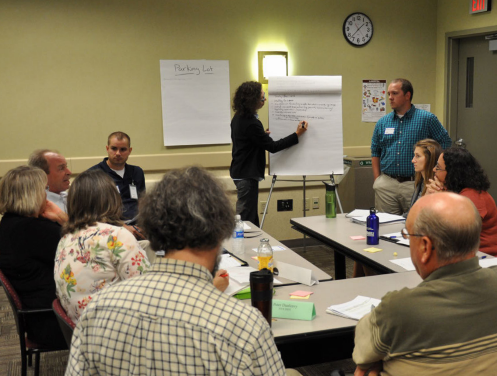
Stakeholder workshop

records and mapping along state boundaries, and establish multi-state email alerts. iMapInvasives staff should also work with NatureServe, PRISMs, neighboring states, and Canadian provinces to advance data sharing capabilities by leveraging existing technology.