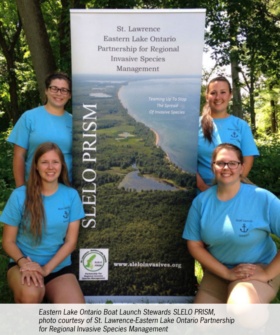
Eastern Lake Ontario Boat Launch Stewards SLELO PRISM, photo courtesy of St. Lawrence-Eastern Lake Ontario Partnership for Regional Invasive Species Management

Programs (voluntary partnerships between private landowners and the NYSDEC to protect habitat), and Federal grant or easement programs, can be utilized to advance such initiatives (Section 7).