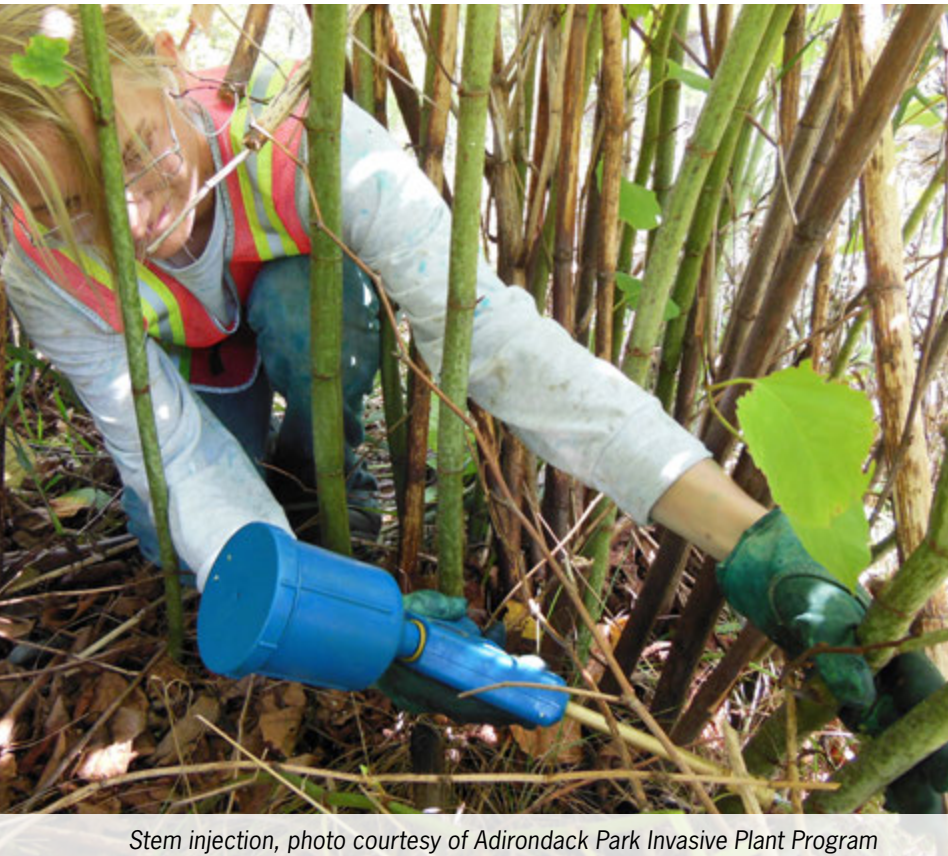
Stem injection

implement IS management action(s) should be evaluated, perhaps by issuance of general permits informed by vetted BMPs for IS management actions. Similarly, opportunities to increase efficiencies in procurement of resources will serve to increase the speed to which management actions can be implemented for a verified early detection.