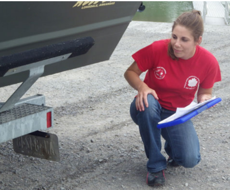
Watercraft inspection