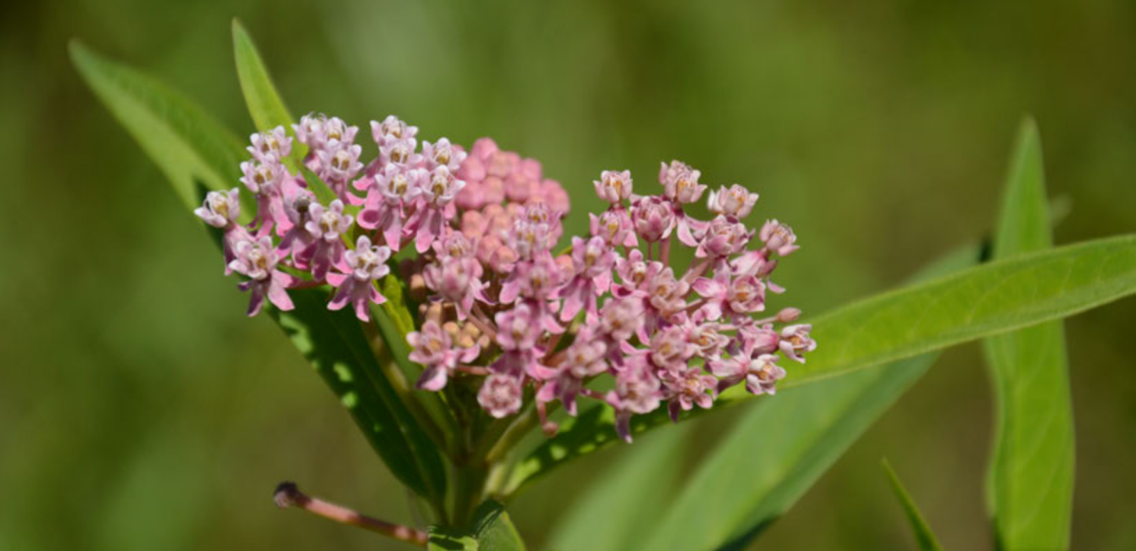
Swamp milkweed

white-tailed deer impacts with priority IS management areas. Additionally, the IS Coordination Section should seek opportunities to collaborate with the NYSDEC Division of Fish and Wildlife during future white-tailed deer management plan updates to identify and include mutually beneficial management strategies.