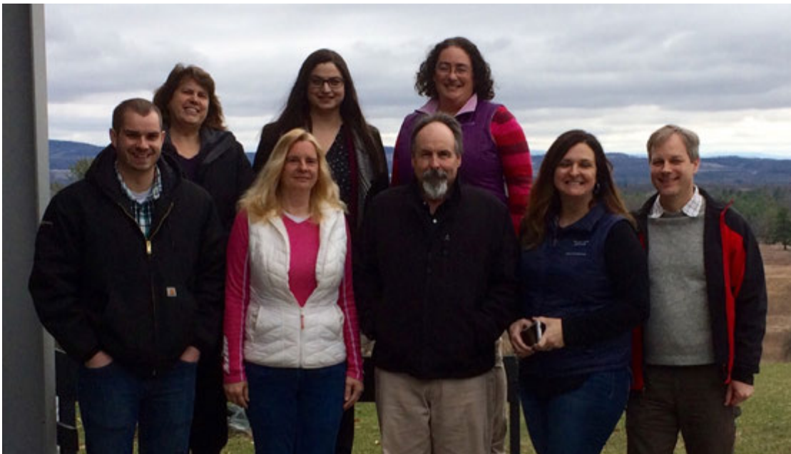
PRISM coordinators, photo courtesy of Capital / Mohawk Partnership for Regional Invasive Species Management