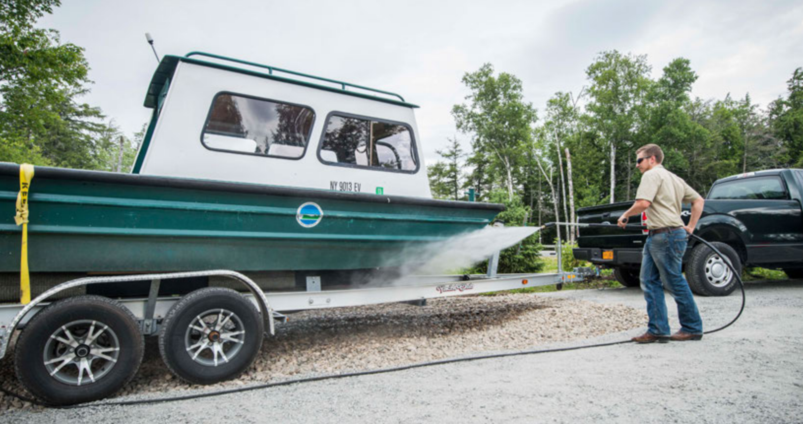
Boat wash station