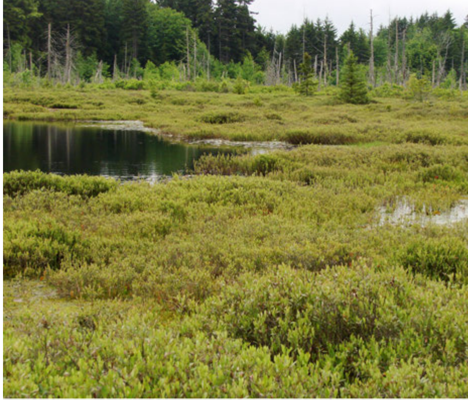
Dwarf shrub bog, photo courtesy of New York Natural Heritage Program

To address prioritization, emphasis should be placed on development and implementation of a State-level priority setting process, which includes assessing risks to the environment, economy, and public health. State-level prioritization of species and locations would facilitate cooperation among IS Council members, and should consider threats to both public and private lands. As part of the priority setting process,