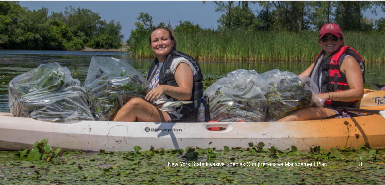
Water chestnut pull

A species that has the potential to cause significant harm to New York’s economy, ecological well-being and/or human health and could be effectively contained through regulatory programs and is listed as regulated under 6 NYCRR Part 575.4.