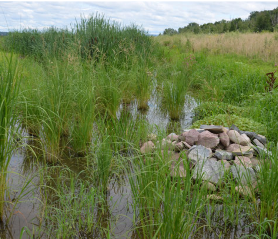
Wetland with habitat structure