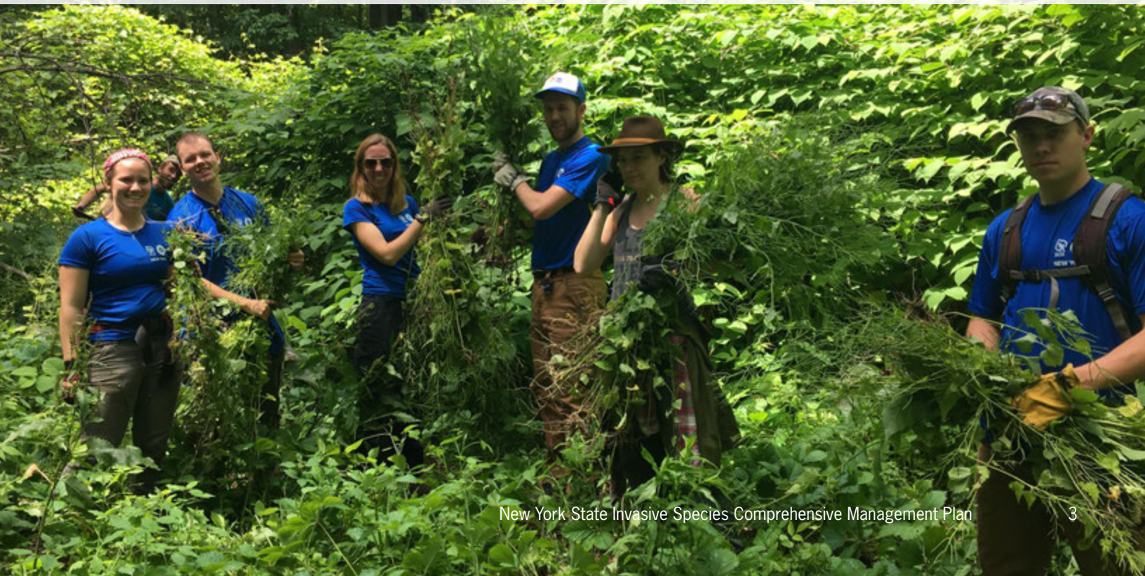
Invasive species manual control

Each initiative includes recommended actions to guide the management activities of State agencies, and to align the priorities of regional and local natural resource managers to State-level actions. Ultimately, the goal of the ISCMP is to help minimize the introduction, establishment, and proliferation of invasive species thereby limiting potential negative impacts. By including a focus on ecosystem resilience, this comprehensive management plan recognizes the important role that ecosystems themselves play in the dynamics of invasive species. While resilient ecosystems may be more resistant to invasive species, they also will likely maintain a greater capacity to recover from their impacts. This Plan positions NYS to continue its role as a leader in the management of invasive species and protect our natural resources for future generations of New Yorkers.