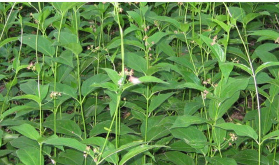
Pale Swallowwort in the SLELO Region