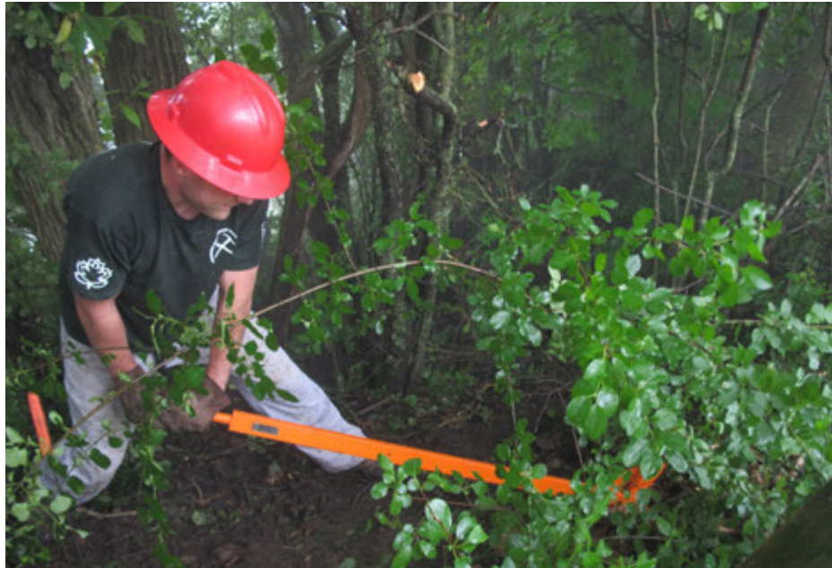
Buckthorn removal in Thatcher Park