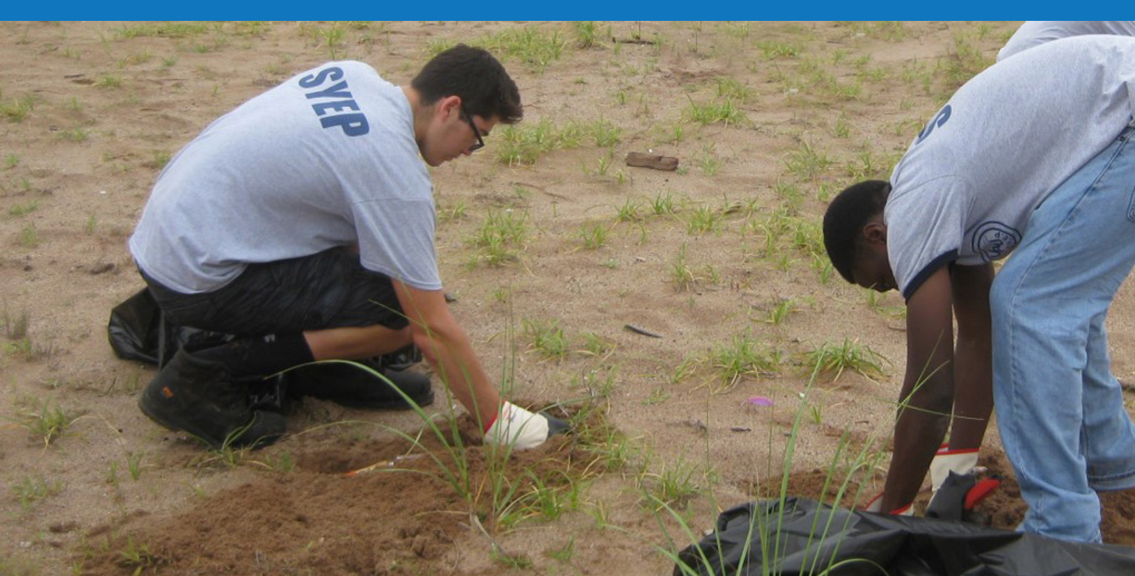
Sand sedge removal