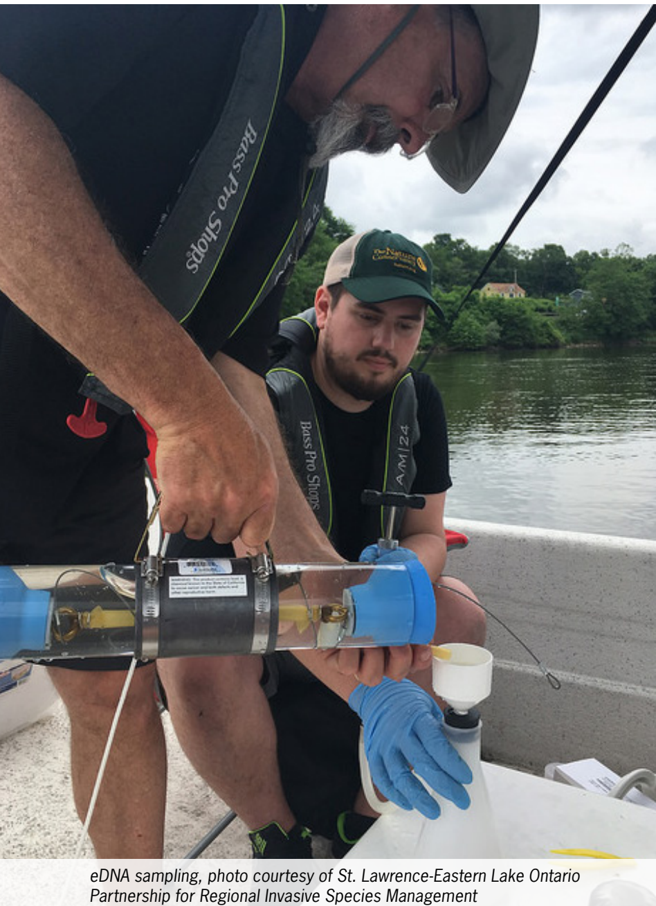
eDNA sampling, photo courtesy of St. Lawrence-Eastern Lake Ontario Partnership for Regional Invasive Species Management

equipped to provide reliable results by minimizing potential DNA contamination. Develop BMPs for the dissemination and application of eDNA results (e.g., confirmation protocols). Advance eDNA technology by gathering the baseline data required to perform risk and change analyses.