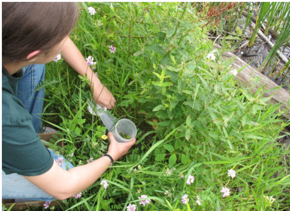
Biocontrol, Galerucella beetle release

Because of the dispersed nature of IS responses, current or proposed projects being implemented by the IS Council and partners should be added to a master schedule and mapped to identify procurement, coordination, and knowledge sharing opportunities among resource managers. Additionally, a streamlined permitting process to