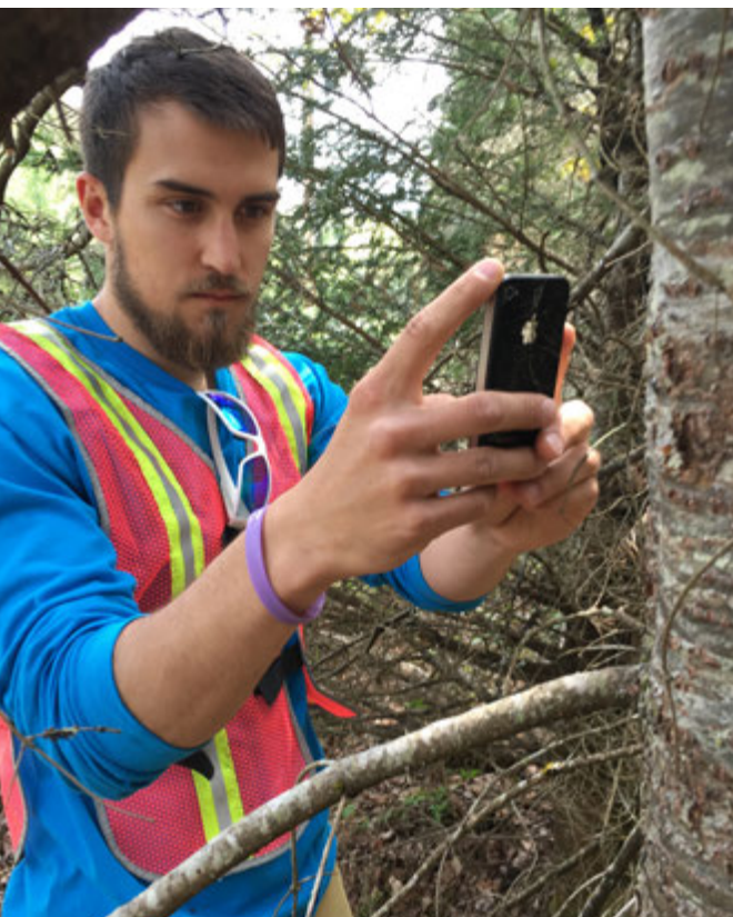
HWA survey, photo courtesy of Adirondack Park Invasive Plant Program