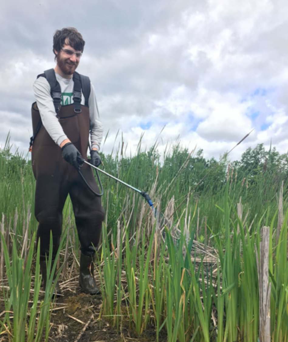
Herbicide application