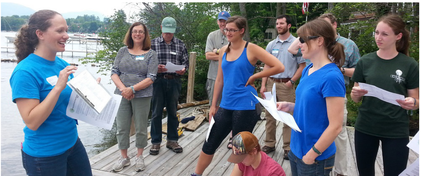
AIS training at Bolton Landing

The need for greater public awareness and engagement regarding IS can be addressed by improving public access to IS information, so residents can easily find appealing, accurate sources of IS knowledge through media they rely on most heavily. In addition to raising awareness, outreach materials should focus on behavior changes that are likely to control IS effectively without being too cost-prohibitive or time consuming, as these factors negatively affect people’s willingness to engage and implement management practices. Education and outreach efforts should be targeted toward specific audiences whose behavior changes are most likely