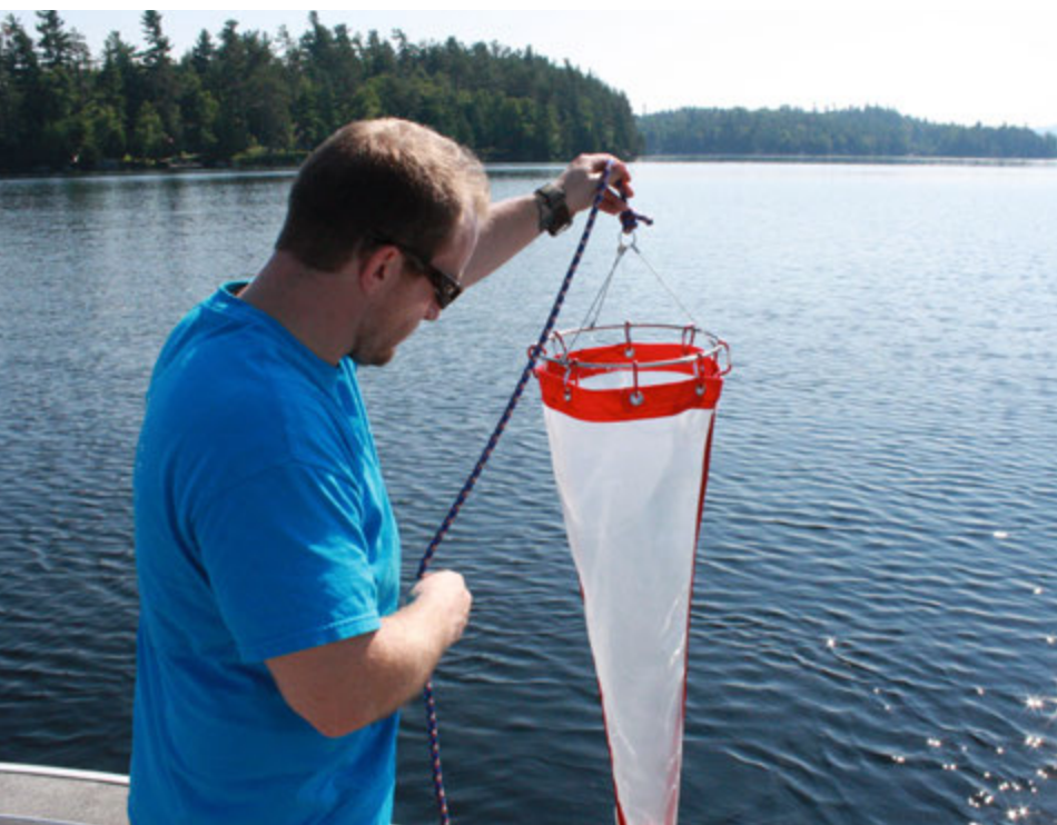
Monitoring, photo courtesy of Adirondack Park Invasive Plant Program

A centralized clearinghouse for information regarding the success of management practices would assist partners with decision making and resource allocation. The value of the information in the centralized clearinghouse would be enhanced by requiring IS Council members, cooperators, and contract partners to explicitly define the objectives of their IS programs and activities, and to measure and report relevant measures of success in achieving these objectives. An engaged research community can provide practical and robust indicators of ecosystem functions resulting from IS management efforts. When done in conjunction with tools such as iMapInvasives, this approach will facilitate information sharing and strengthen the adaptive management approach.