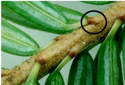
Needles are connected by a peg.