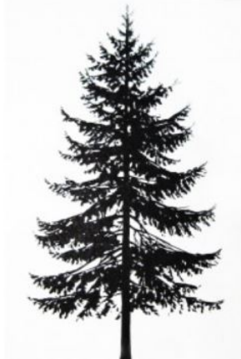
Norway Spruce Silhouette ( Pinaceae picea )