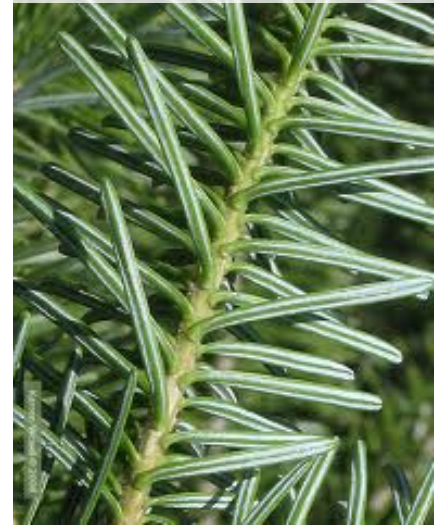
Balsam Fir: Not attacked by HWA