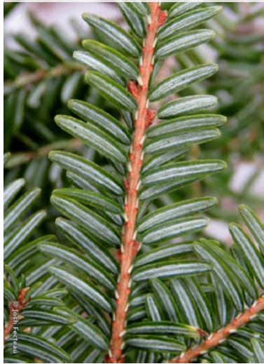
Eastern Hemlock: Check for Signs of HWA