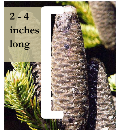
Balsam Fir: Not attacked by HWA