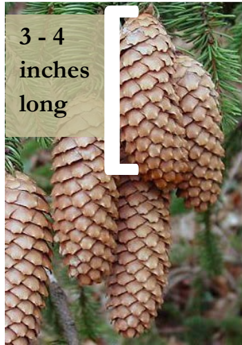
Norway Spruce: Not attacked by HWA