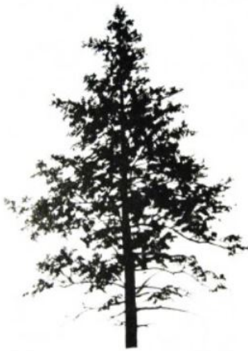
Eastern Hemlock Silhouette ( Tsuga canadensis )