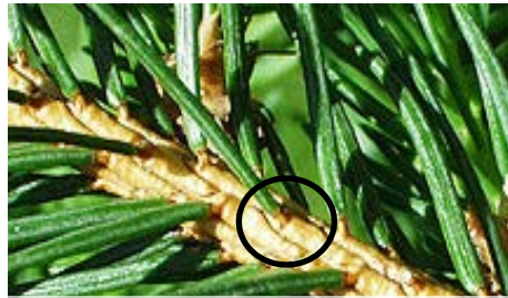
Needles are connected by a peg.