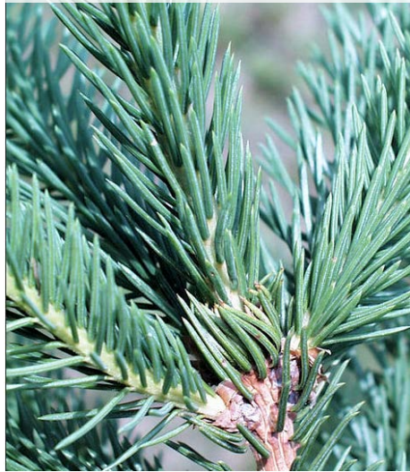
Norway Spruce: Not attacked by HWA