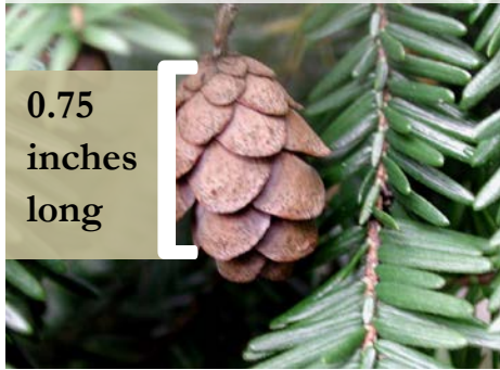
Eastern Hemlock: Check for Signs of HWA