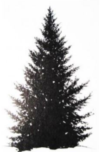
Balsam Fir Silhouette ( Abies balsamea )