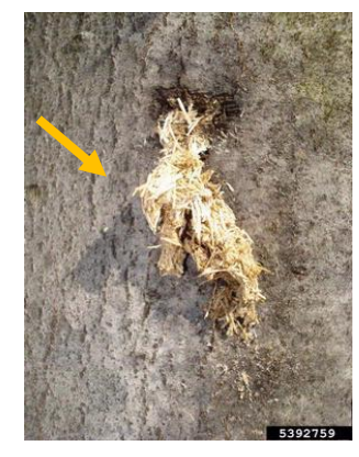
Round exit holes (6-14mm in diameter)

➤ Presence of holes from insect mouth parts (mandibles) and ovipositer (egg insertion)