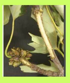
➤ Presence of Cracks and or missing bark; dead branches discoloration & loss of leaves