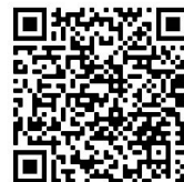
Photo Credits: Cover photo: Midwest Invasive Species Information Network, https://www.misin.msu.edu/facts/detail/?project=&id=340&cname=Tench . Tench ID photo credit: http://www.hlasek.com/tinca_tinca1de.html . Tench sightings map Sunci Avlijas, McGill University, Canada. Cited Resources: (1) NPR News WBFO 88.7, https://news.wbfo.org/post/will-tench-be-next-great-lakes-invasive-species-problem (2) Great Lakes Connection, http://ijc.org/greatlakesconnection/en/tag/tench/ .