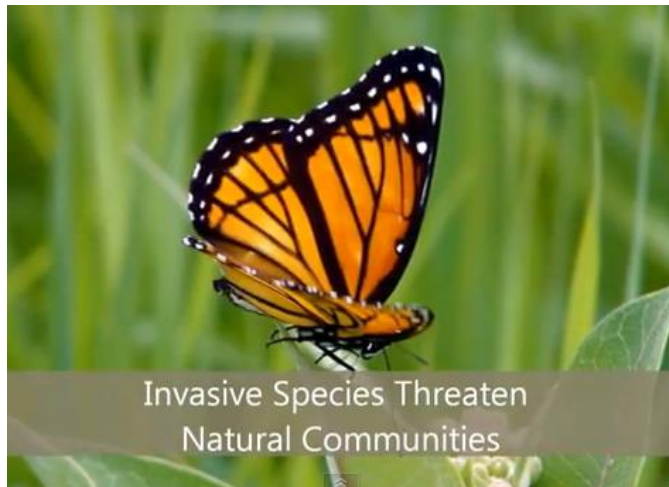
Figure 6: Segment clip from the Digital Short Video.