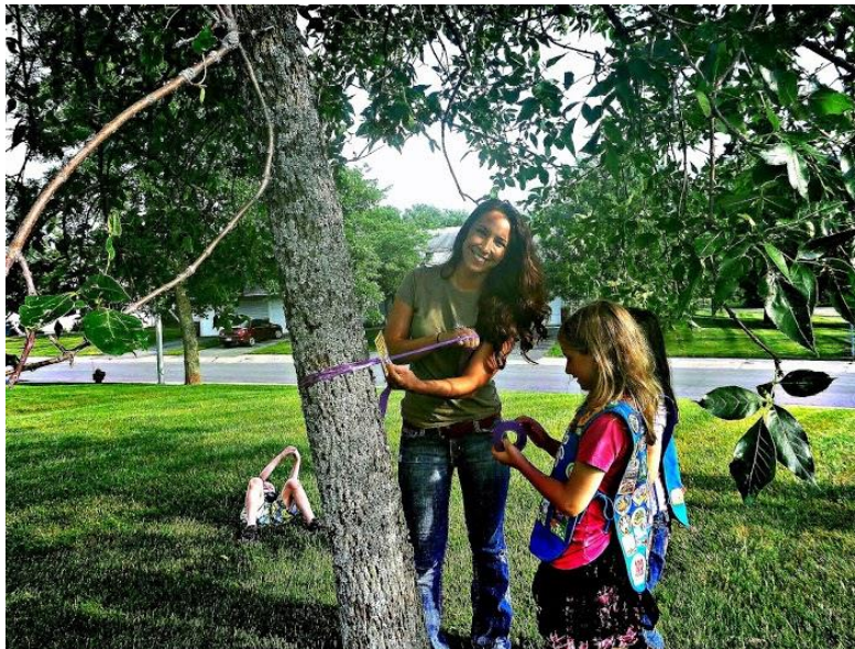
Figure 4: The SLELO PRISM Outreach Coordinator helps Girl Scouts tag Ash Trees at the Fort Drum Military Facility.