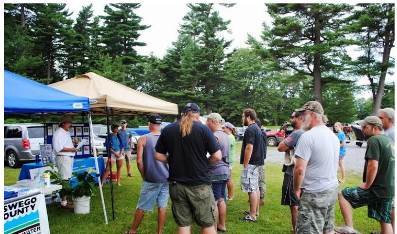
Figure 3. Participants gather at the Water Chestnut Training and Hand Pull event to learn about invasive species.

Target Audience: The audience for this event was the general public. This includes but is not limited to SLELO PRISM partners, highway personnel, sportsmen and women, boaters, gardeners, landscapers, hikers, birders, photographers, farmers, campers and other interested persons.