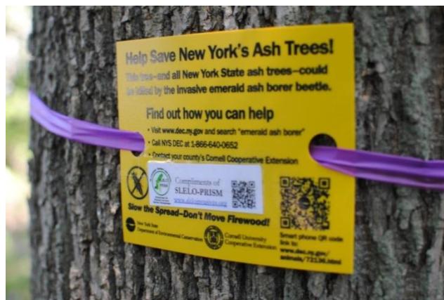
Figure 5: Awareness tags as displayed on Ash Trees.

Summary/Overview: Over 34 individuals from various interest groups were reached through this program. Awareness tags (Figure 5) remain on Ash Trees until winter months when most are removed for recycling. As a result, the tags provide education and outreach to hundreds of citizens indirectly. Moreover, thousands of individuals have been indirectly reached through media avenues. On Fort Drum two newspaper stories and one digital news story reported on this event.