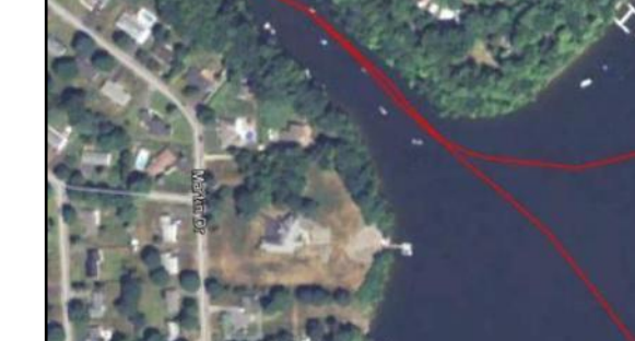
Figure 12: HPA-7