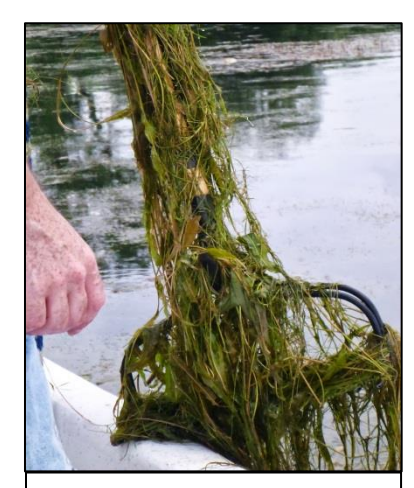
Figure 6: Photo of rake-toss with samples.

SLELO-PRISM c/o The Nature Conservancy 269 Ouderkirk Road. Pulaski, NY 13142 Rob Williams, Coordinator