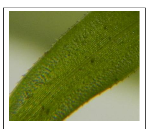
Figure 9: Magnified view of serrated leaf margin.