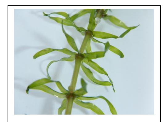
Figure 8: Close-up of 5,6 leaf whorl.