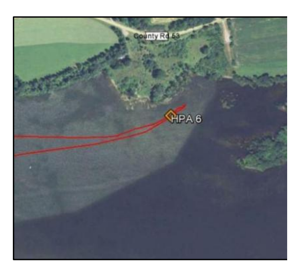
Figure 16: HPA-6