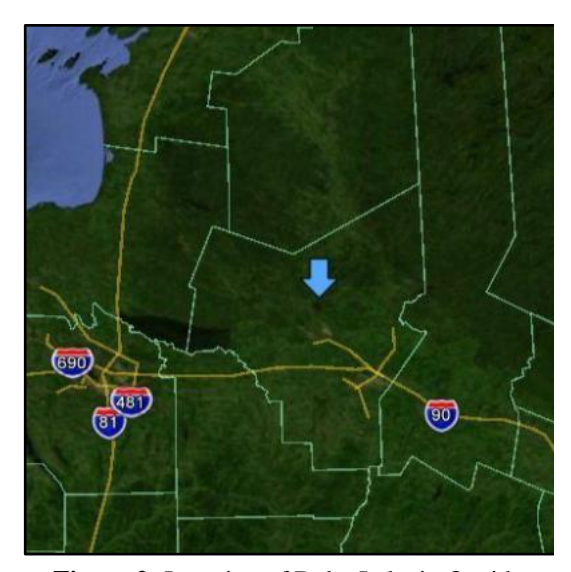
Figure 2: Location of Delta Lake in Oneida County

Delta Lake is located in the center of Oneida County New York (Figure 2), just north of the Town of Rome. The open water surface area is approximately 2,300 acres and includes 19 miles of shoreline (Figure 3) with a maximum depth of 60 feet. This man-made reservoir was created following the construction of the Delta Dam on the Mohawk River, which began in 1908 and flooded the area where the original town of Delta once stood. The purpose of the dam was to guarantee sufficient water for the Barge and Erie Canal system, and also to prevent spring flooding in the Town of Rome.