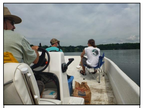
Figure 5: Carolina Skiff powerboat used on Lake Delta

A flat-bottomed motorboat (Figure 5) was used to transport the crew to each HPA location. Samples were collected by throwing a weighted rake (rake toss method, Figure 6) attached to a rope into the water from both sides of the boat to gather submerged aquatic vegetation samples and to measures water depth (Table 2). This technique allowed the crew to determine what species were present in that location. Once the samples were collected, the species were identified, recorded, and determined to be either invasive or noninvasive (Table 2). Visual observations of vegetation in the area were also recorded.