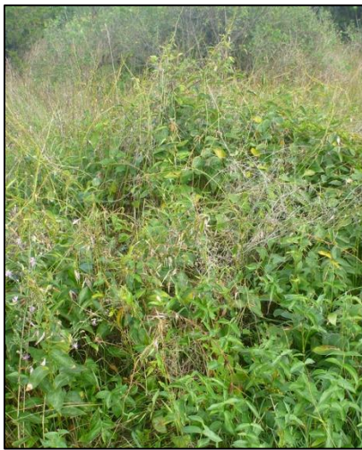
Figure 4: Swallow-wort observed growing along Route 3 in Jefferson County.

Four species included in the SLELO-PRISM Target Management Species list 1 were observed along the survey route: Phragmites ( Phragmites australis ), Purple Loosestrife ( Lythrum salicaria ), Japanese Knotweed ( Polygonum cuspidatum ) and Swallow-wort ( Cynanchum sp.). No species included on the SLELO-PRISM Prevention Species list were observed.