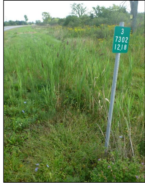
Figure 3: Phragmites observed growing along Route 3 in Jefferson County.

Invasive species observed to be growing within the NYSDOT's right-of-way were inventoried by recording the species, the side of the road where the species was observed, and a visually estimated length of roadside affected by the species (using the known length of the survey vehicle as a reference). Occurrences were marked as a single point near the observed center of the invasive species occurrence. Several exceptionally long infested roadside areas were measured by marking start and end points with the GPS in order to later measure the distance using GIS software; a central point was then identified for the purpose of mapping the occurrence. All invasive species occurrences were reported to the iMapInvasives invasive species database.