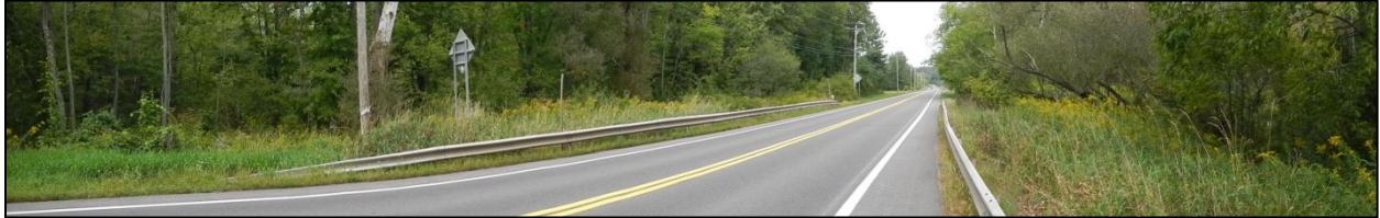
Figure 1: View of Route 3 along the Great Lakes Seaway Trail.

August 31 and September 4, 5, 6, 7 & 10, 2012