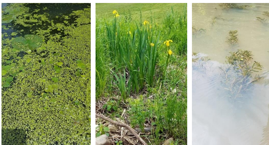
Fig 3: (From Left to Right) European Frog-bit, Yellow Iris, Curly-leaf Pondweed

Key: WC = Water chestnut EM = Eurasian water-milfoil KW = Japanese knotweed FB = European frog-bit YI = Yellow iris CP = Curly-leaf pondweed