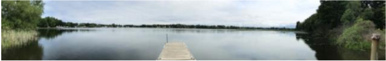
Figure 1. Panoramic view of Salmon River Estuary at Pine Grove Road boat launch.

Report prepared by Sarah Kirkpatrick and Emma Gutierrez on June 6 th , 2018