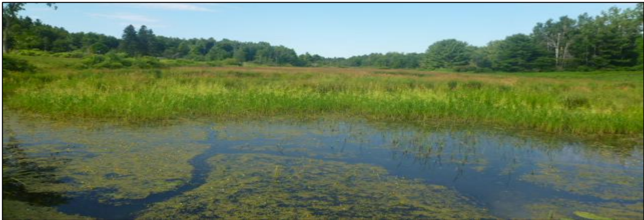
Figure 1. Panoramic view of Fish Creek Wildlife Management Area at HPA 4.

Report prepared by Caitlin Muller and Ben Hansknecht on July 28 th , 2015