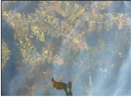
Figure 2. Eurasian water milfoil found at HPA 2.

site individuals were sparsely distributed. These plants could be displaced by the presence of wild parsnip.