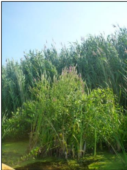
Figure 3. Phragmites and purple loosestrife found at HPA 6.

Aquatic surveys were conducted on July 27 th and consisted of four rake-tosses. HPA 2 and 6 required the use of canoes to survey for aquatic invasive species. European frog-bit ( Hydrocharis morsus-ranae ) was seen at the four aquatic HPA's. HPA's 2 and 6 had populations of Eurasian water milfoil ( Myriophyllum spicatum ), which was also seen in varying population sizes along the path traveled by canoe (Figure 2). At HPA 6 the 2013 field crew had observed a large population of Phragmites ( Phragmites spp. ) along the perimeter along with purple loosestrife ( Lythrum salicaria ) (Figure 3.). These populations were still present in the 2015 survey.