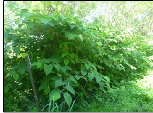
Figure 3. Japanese knotweed found along West Lake Road.

As seen by the 2013 field crew a large patch of Japanese knotweed was spotted before HPA along West Lake Road (Figure 3). The patch was larger than previously observed. At HPA 5 there was a small stand of Eastern hemlock, which would be an ideal spot for future monitoring.