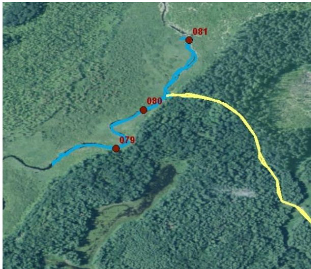
Figure 6. HPA 5 aquatic survey, track seen in blue.