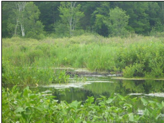
Figure 4. Dam blocking a previously sampled point at HPA 1.

At HPA 5 one of the survey points could not be reached due to the overgrowth of shrub willow ( Salivaveae family) (Figure 5). The new survey point was conducted at a cove near the overgrown shrub willow. This site may need to be re-evaluated due to the rapid conversion of the creek.