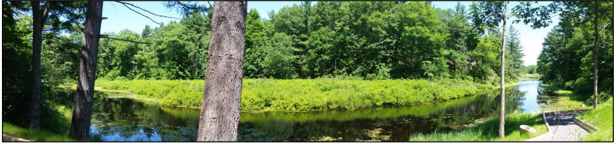
Figure 1. Panoramic view of HPA 1 at Pope Mills Parking Area.

Report prepared by Elizabeth MacEwen and Caitlin Muller on 6/26/2015