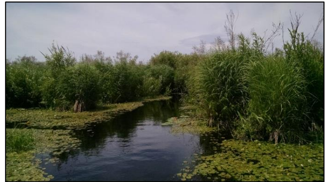
Figure 5. Overgrowth of shrub willow.