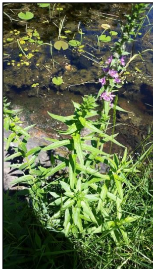
Figure 2. Purple loosestrife along the trail of HPA 1.

The Early Detection field crew surveyed Fish Creek Wildlife Management Area in June of 2015 (Figure 1). The crew surveyed previously established terrestrial highly probable areas (HPA's) and aquatic sites that were established by the 2013 field crew. At each HPA glossy buckthorn ( Rhamnus frangula ) was present. Most HPA's and roadsides surrounding the Management Area had wild parsnip present. Every water body surveyed had European frogbit ( Hydrocharis morsus-ranae ) present. Smaller creeks along Factory Road had large amounts of frogbit present, which was not noted in the 2013 field report.