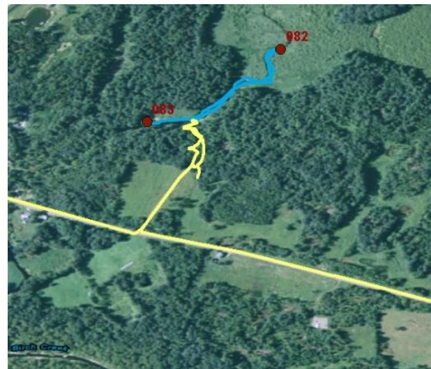
Figure 7. HPA 1 aquatic survey, track seen in blue.